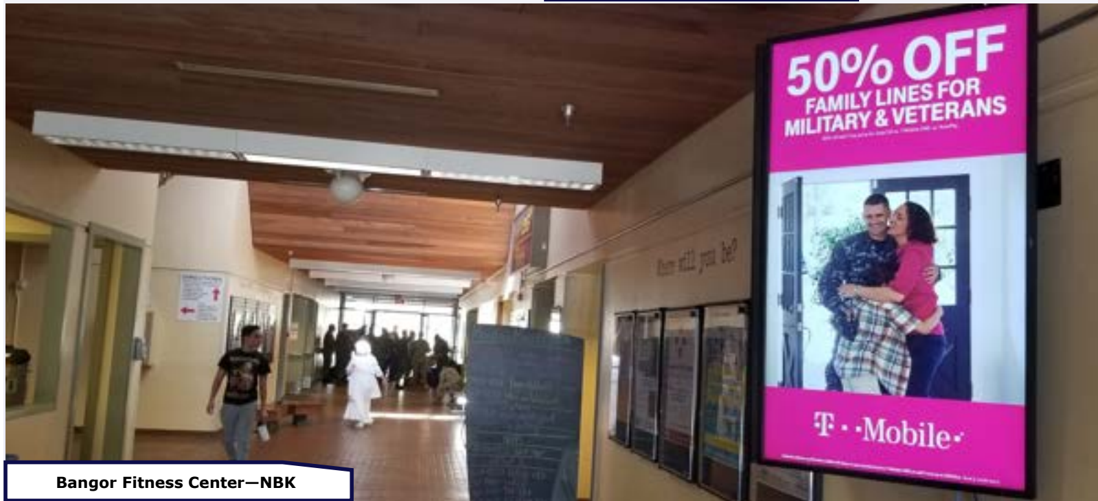
Bangor Fitness Center—NBK