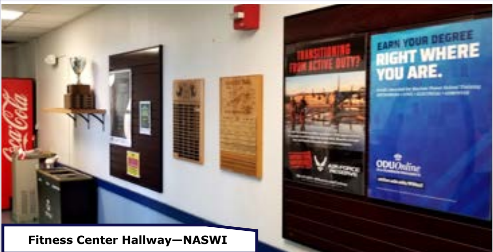
Fitness Center Hallway—NASWI