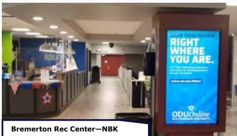
Bremerton Rec Center—NBK