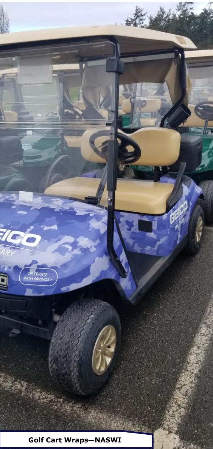
Golf Cart Wraps—NASWI