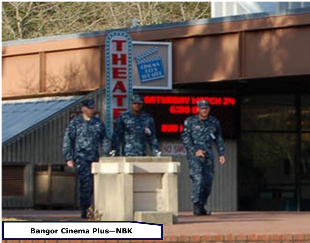
Bangor Cinema Plus—NBK