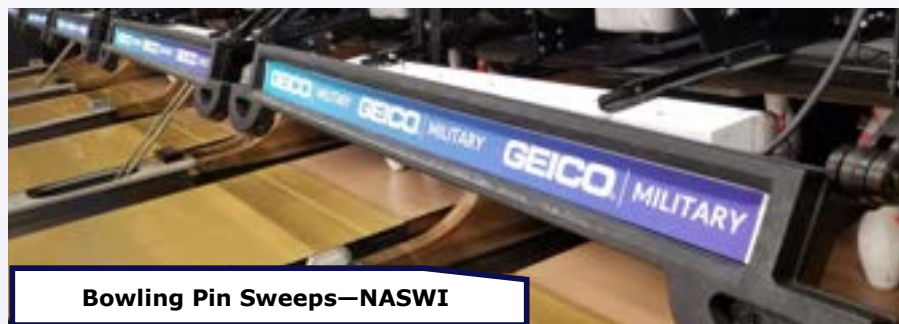
Bowling Pin Sweeps—NASWI