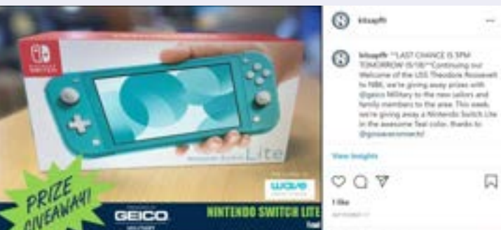
Social Media Contest—NBK