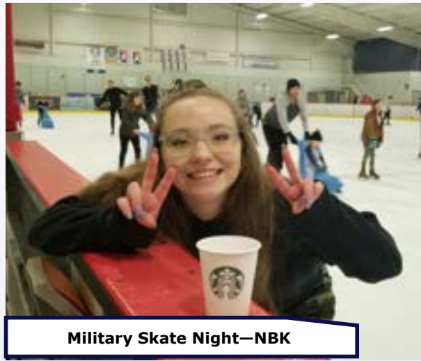
Military Skate Night—NBK