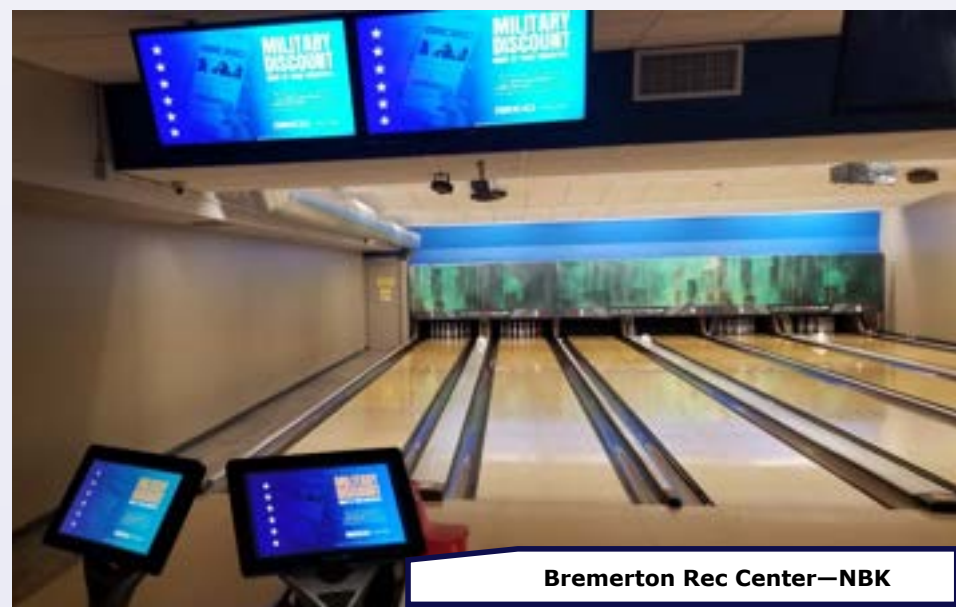
Bremerton Rec Center—NBK

Over 45,000 visitors a year stop by our centers.