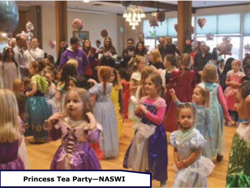
Princess Tea Party—NASWI