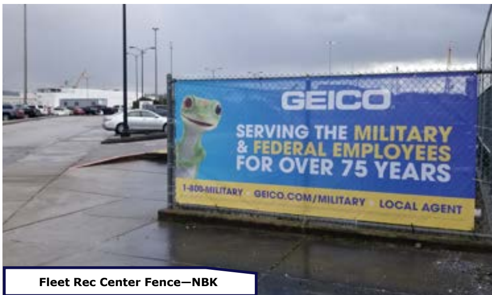
Fleet Rec Center Fence—NBK