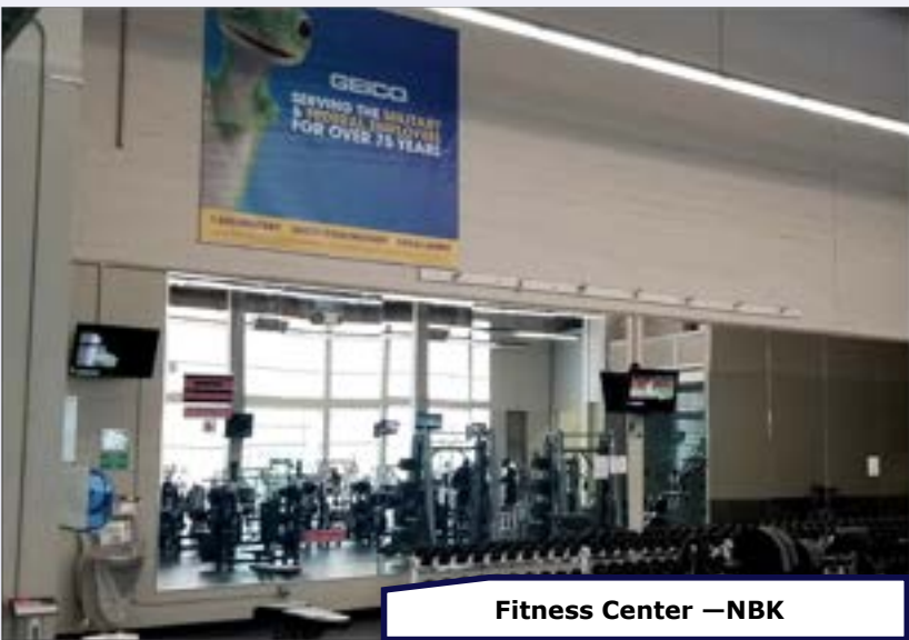
Fitness Center —NBK