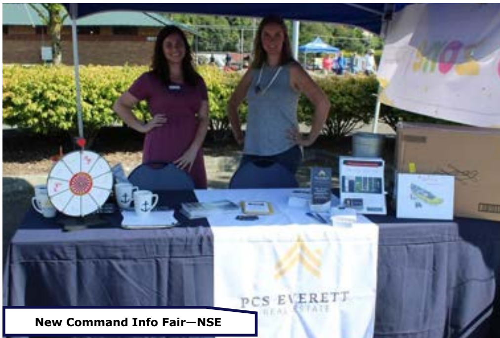
New Command Info Fair—NSE