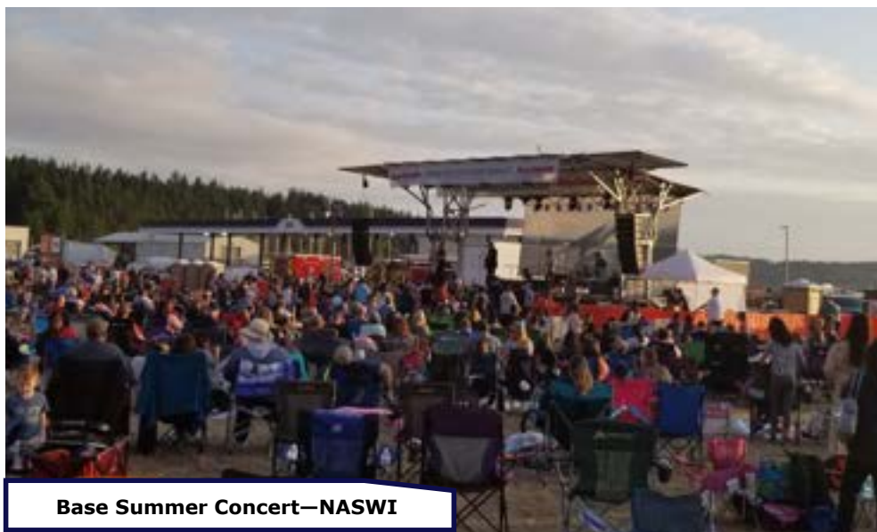
Base Summer Concert—NASWI