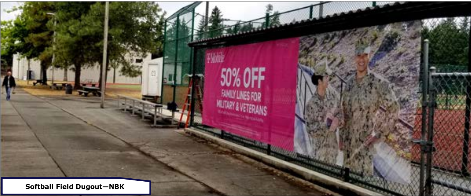
Softball Field Dugout—NBK