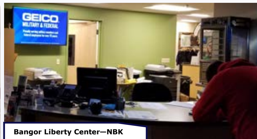
Bangor Liberty Center—NBK