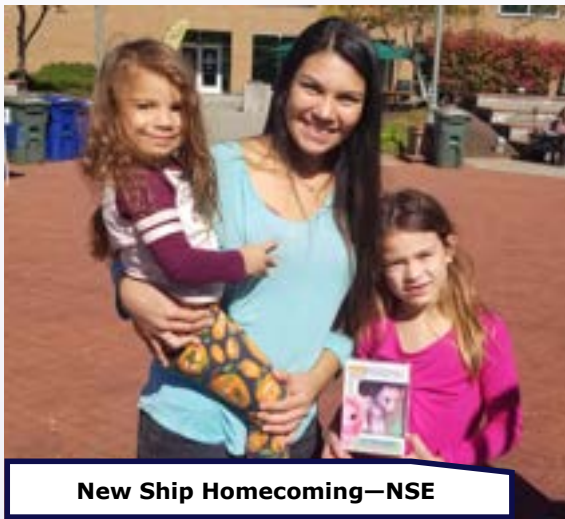
New Ship Homecoming—NSE